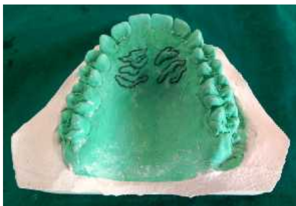
Figure.2 showing the highlighting of rugae on the cast with lead pencil