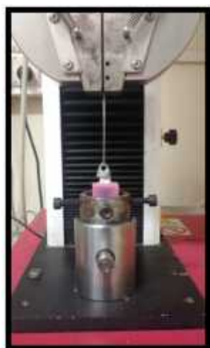
Figure 5 Dislodged crown from tooth

The retention testing of all samples were performed on the computerized software based Universal testing machine (Instron, Model no. 3345, and UK). At the 0.5 mm/min. cross-head speeds, a vertical tensional force was applied on the crowns consistently 4 . The maximal tensile force used to separate the crown was recorded in Newton. (Fig. 5)