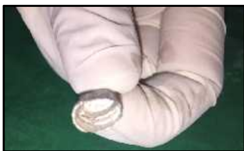
Figure 4 Crown with two grooves

The groove placed on the internal surface of crown was approximately 3 mm from the cervical margin and 0.5 mm in depth and 1.4 mm in width. (Fig.3)