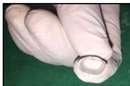
Figure 2 Unaltered Crown