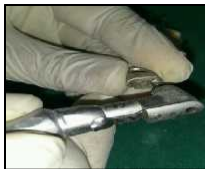
Figure 1 Placing one and two horizontal grooves on the internal surface of the crown

Horizontal circumferential groove / grooves were placed (Fig.1) for Group II and III whereas Group I acted as a control group. (Fig.2) For Group II, One horizontal circumferential groove was placed free hand on the internal surface of all 30 crowns by inverted cone bur (#37, SS White RA-36.USA) using Laboratory Micromotor and contrangle handpiece (Marathon - 3+, Marathon, Korea).