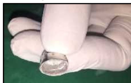
Figure 3 Crown with single groove