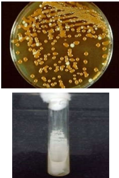
Fig 3 Brown colour colonies on Bird Seed Agar Creamy white colour colonies on Sabouraud Dextrose Agar

CSF culture was performed on Sabouraud Dextrose Agar (SDA) and Bird Seed Agar (BSA) and incubated at 25 0 C & 37 0 C for 48-72 hrs. (Fig. 3)