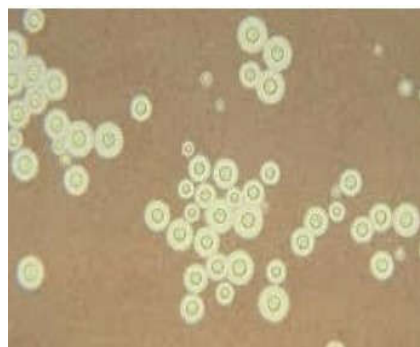
Fig 1 India ink preparation showing encapsulated budding yeast cells of C. neoformans . Narrow based budding yeast cells variable sized measuring in 5-25 \mu .

Microbiological Investigations: The CSF samples were microbiologically analysed for wet mount examination, Gram and India ink staining (Fig.1), Cryptococcal Latex Agglutination Test (LAT) was performed with CALAS (Bio-Rad, Pastorex™Crypto plus) (Fig.2).