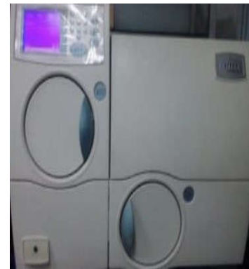
Fig 4 Automated yeast identification and susceptibility system- VITEK 2 Compact™ (Biomérieux, India)

On the other hand, 31 cases of Cryptococcal meningitis were also tested for HIV antigen/antibodies (as per the NACO HIV testing guidelines).