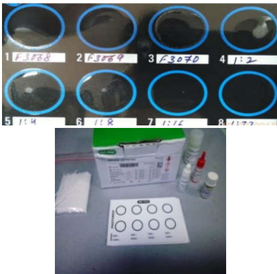
Fig 2 Cryptococcal latex Agglutination Test (Biorad Kit)

CSF culture was performed on Sabouraud Dextrose Agar (SDA) and Bird Seed Agar (BSA) and incubated at 25 0 C & 37 0 C for 48-72 hrs. (Fig. 3)