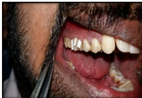
Fig 2 Collection of GCF samples