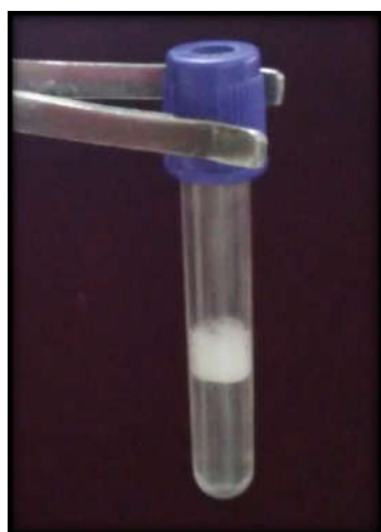
Fig 1 Collection of saliva samples