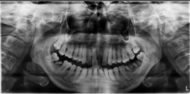
Figure 6 Orthopantomogram (AFTER EXTRACTION)