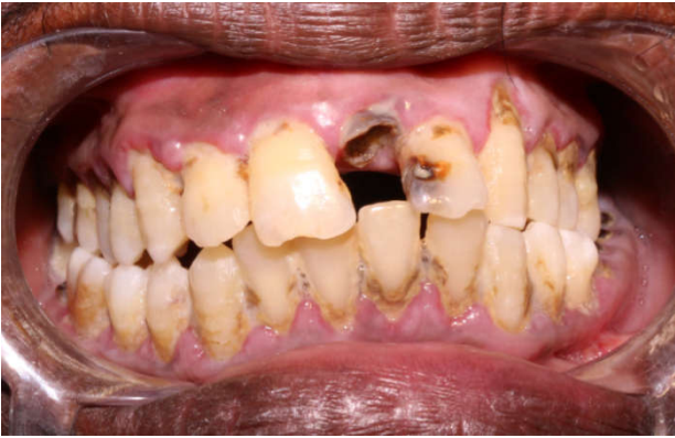
Figure 5 Intra-oral picture