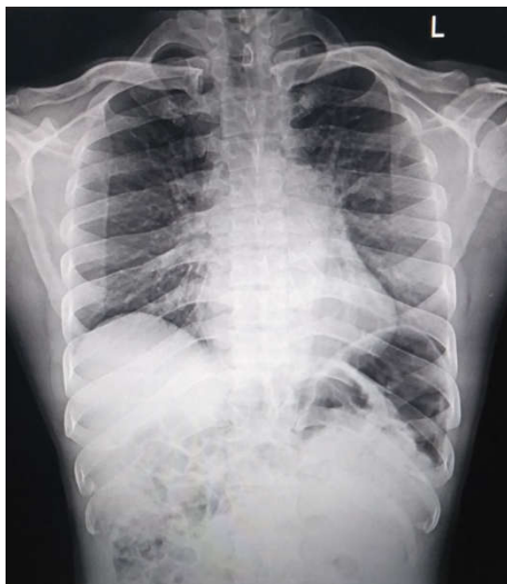
Figure 8 Chest X-ray