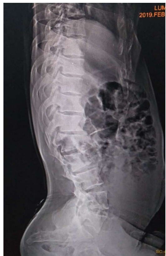
Figure 10 Lateral Spinal X-ray