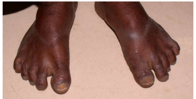
Figure 3 Feet of the patient