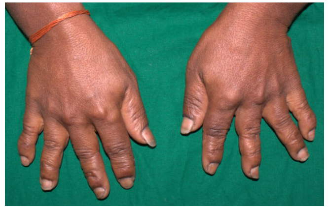
Figure 2 Hands of the patient