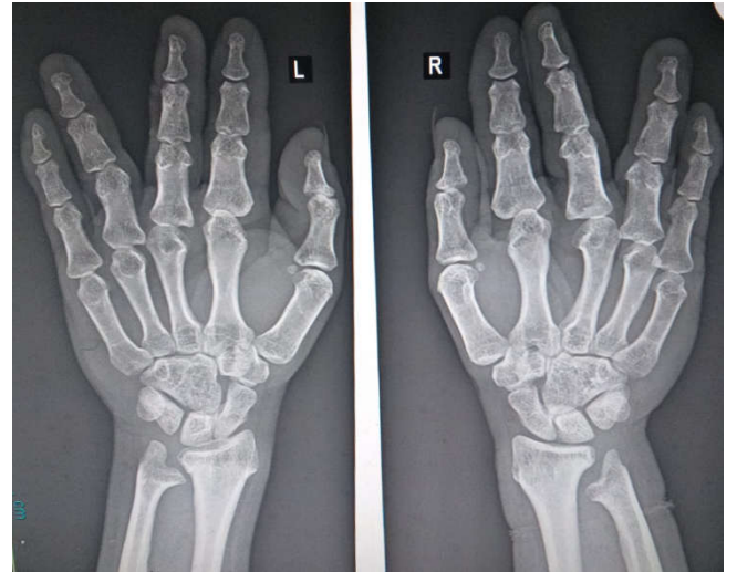
Figure 9 Hand and wrist X-ray