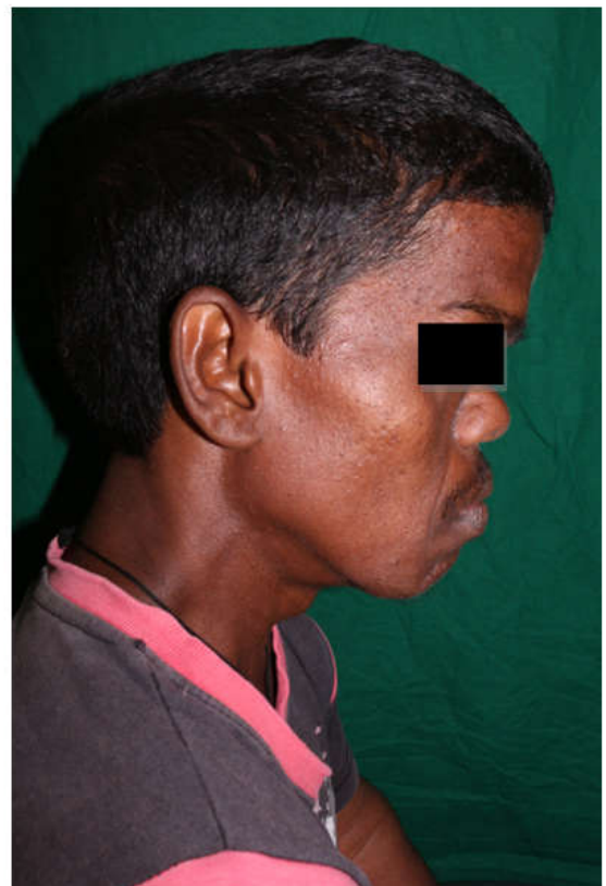
Figure 4 Lateral view of the patient