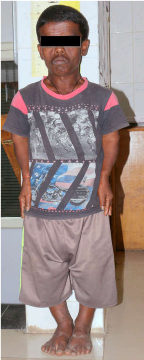
Figure 1 Profile picture of the patient

and wrist radiographs showed trident hand configuration. [Figure – 9 depicts the Hand and wrist X-ray] The radiograph of spine revealed scalloping of lumbar vertebrae compared to thoracic vertebrae (lumbar hyperlordosis). [Figure – 10 depicts the Lateral Spinal X-ray] Based on the history, clinical examination and radiological investigations, the final diagnosis arrived at achondroplasia. The patient was subjected to oral prophylaxis, restoration of decayed teeth, extraction of root stumps followed by replacement of missing teeth