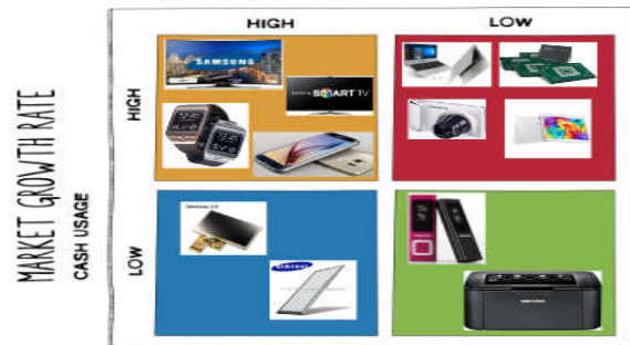
ESSENTIAL MARKETING MODELS HTTP://BIT.LY/SMARTMODELS