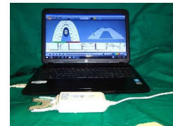
Fig 1 T-Scan III system (Tekscan) and associated software

Force distribution was recorded using the T-Scan III computerized occlusal analysis system (Software Version 8.0, Tekscan Inc. South Boston, MA, USA) uses an electronically-charged, mylar-encased recording sensor (High-definition Generation IV sensor, Tekscan Inc. S. Boston, MA, USA) (fig1). 6, 8 The recording sensor is placed intraorally between the dental arches to capture real-time occlusal force and time-sequence data when a subject intercuspatates or makes excursive movements across its recording surface. The software processes the occlusal data of any recorded occlusal event for graphical display in 2 and 3 dimensions.