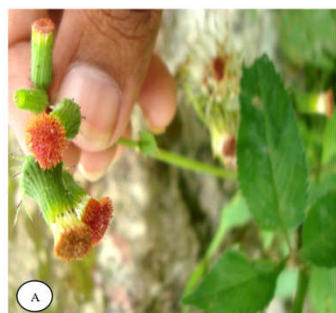
A. Crassocephalum crepidioides individual plant with inflorescence