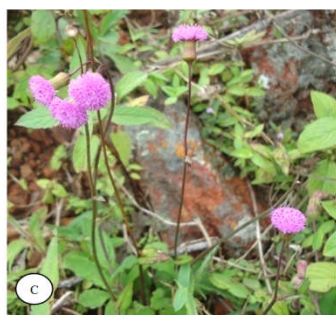
C. Crassocephalum rubens var. sarcobasis whole plant