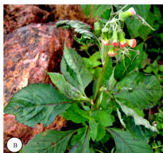
B. C. crepidioides whole plant inflorescence.