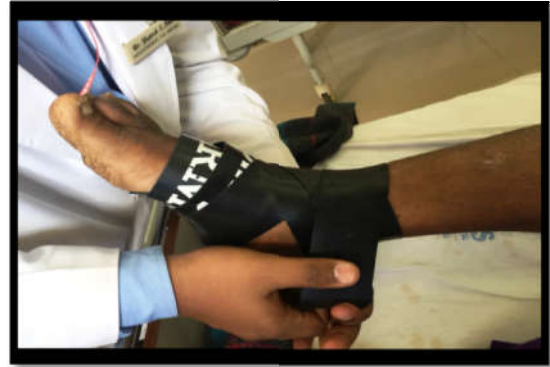
Fig 2 Application of voodoo floss band

eight method, starting from the lateral malleolus then around the achilles tendon and to medial malleolus following in direction towards the end of 5 th metatarsal head, the band was then wrapped around the bottom of the foot and back to origin. Any discomfort was asked to subject during the whole procedure of application. The width of each wrap was covered 50% by another layer of the band. The end of the band was secured under the last wrap of the voodoo floss band 7 .