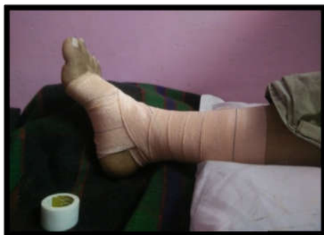
Fig 1 Application of crepe bandage

In the group A, crepe bandage was applied to the ankle joint. The rolled end of the crepe bandage was in one hand facing in upward direction, the free end of the crepe band was placed below the ball of foot that was under the 1 st metatarsal head. To have a better grip the crepe band was wrapped in figure of eight method, which was from foot to ankle and the same is repeated. While wrapping, the toes were kept free and heel was covered by the crepe bandage. A constant pull was maintained so as to have equal tension while wrapping. The crepe bandage was over lapped one-half the width of the crepe bandage in spiral method or spiral reverses method, till just below the knee and the ends of the crepe bandage were secured using adhesive tape. A continuous feedback of the subject was taken regarding any discomfort, and post wrapping assessment of distal blood circulation was done 8 .