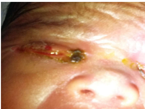
Fig Showing Ectropion of Right Eye Lid