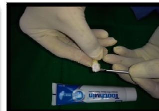
Fig 6 Toothmin application