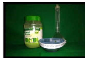
Fig 2 WGS solution