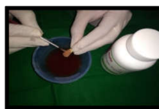
Fig 7 GSE application