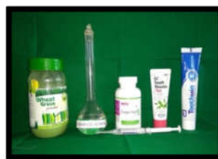
Fig 1 Materials