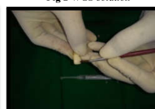
Fig 4 application of CP