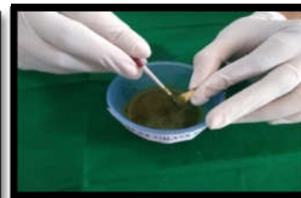
Fig 8 wheat grass application