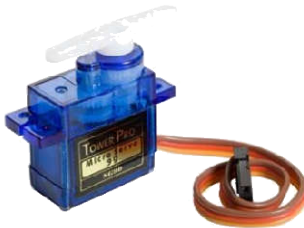
Fig 3 Servo Motor