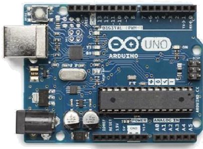
Fig 2 Arduino UNO Microcontroller

Arduino is an open source platform, very useful for prototyping by engineers. As shown in fig.2, it consists of a physical board and IDE (Integrated development environment) for easy prototyping and checking of the codes. The coding for it is done in embedded C language. It consists of an ATMEGA328P microcontroller which is an 8-bit AVR RISC-based microcontroller. Rapid prototyping can be done as it uses a USB cable to upload new code from a personal computer. A power jack gets power at 5V.