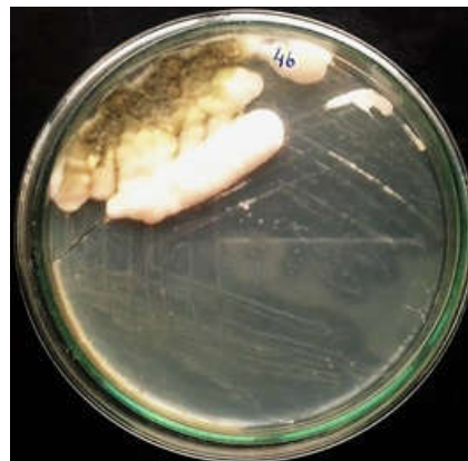
Figure 1 Growth of fungal isolate 4b

Pure cultures of the isolate were maintained on MRBA medium agar slants at refrigerated 4° C temperature and were sub cultured every month. Out of 28 fungi, 03 isolates were found to be growing well. Among the 03 isolates, 4b (Figure 1) (Table 2) showed maximum zone of hydrolysis around colony with maximum lipase activity (2.5) which was selected for further studies.