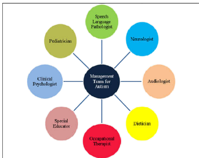
Fig 1 Management Team for Autism

factors. Researchers claim that there is no known single cause for autism spectrum disorder, but it is generally accepted that it is caused by abnormalities in brain structure or function. However, there is every reason to hope in the coming time to know the exact cause of autism, which in turn will lead to more effective treatments, appropriate services & improvements in the lives of those affected by autism. Autism spectrum disorder impacts the nervous system and affects the overall social, cognitive, emotional, and physical health of the affected individual. The range and severity of symptoms can vary widely among individuals. Common symptoms include difficulty with communication & social interactions, obsessive interests and repetitive stereotyped behaviors along with various co-occurring physical and nutritional related conditions (Siegel; 1997).