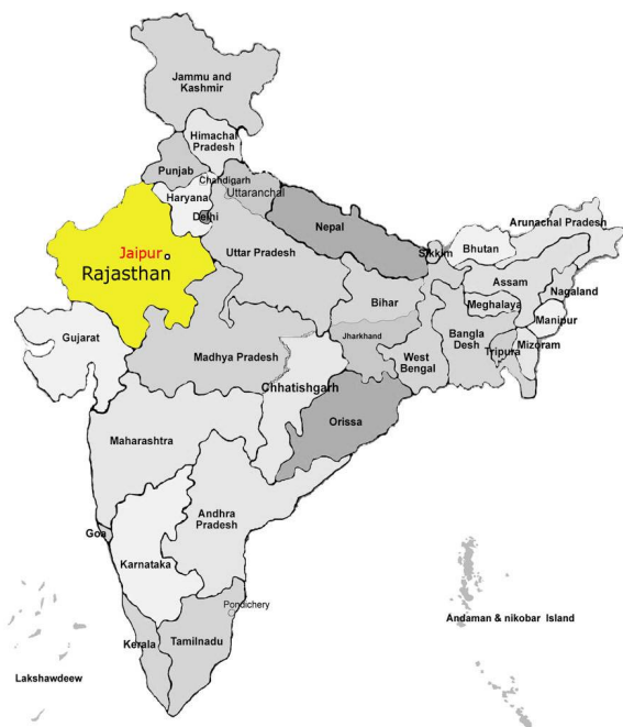
Figure No.1 Radha Krishan Birla Cancer Center, Sawai Man Singh medical College, Jaipur