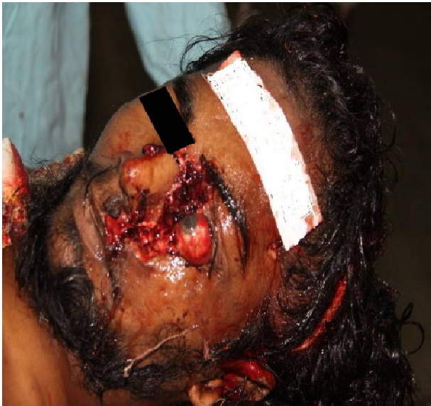
Figure 1 Lacerated wound on left cheek and orbit with protrusion of eyeball

is the major concern in the South-east Asian region also. The overall road traffic fatality rate is 17 per 100,000 population, and in India, it is 16.6. 10 In developing countries like India to cut the cost of transportation, truckers are frequently flouting the rules and causing fatal accidents. The truck carrying rods projecting outside the body frame is common in India. At many places of India, during the day time, there is no restriction for the trucks carrying iron rods, and it poses a grave danger to the public.