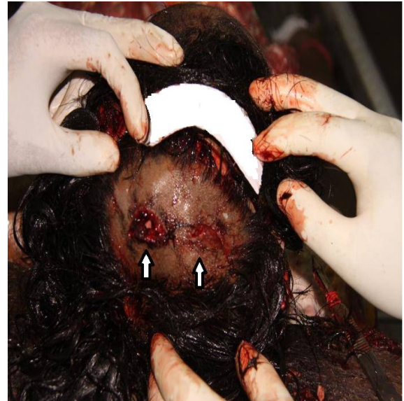
Figure 3 Fracture of right and left parietal bone with displacement of bony chips (shown by white arrows)