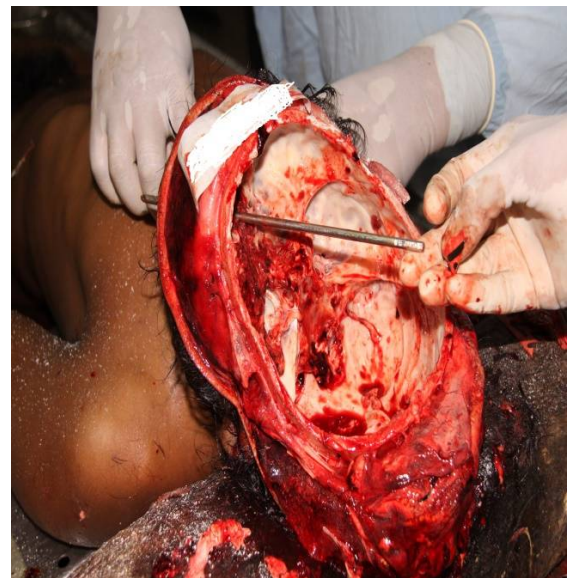
Figure 4 Probing showed that the rod penetrated the skull through theorbital cavity by fracturing the roof of orbit.