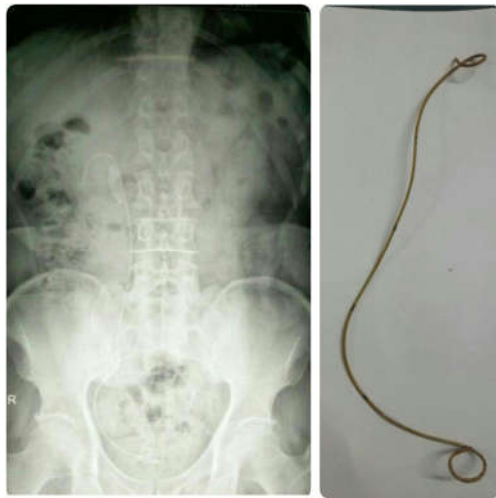
Figure 1 Retained DJ Stent

Of the 24 patients, 14 (58.5%) were retained DJ Stents inserted during previous ureteroscopic procedures, pelvic surgeries [Figure 1].