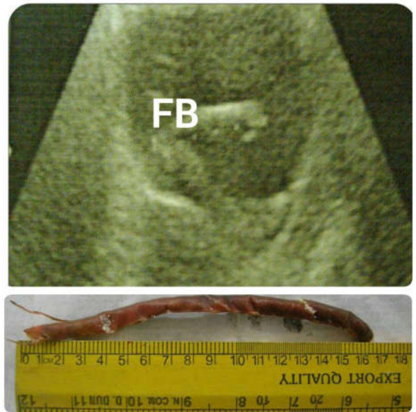
Figure 4 Vegetable foreign body in bladder

Three patients (12.5%) had encrustations over ruptured Foley bulbs. Clinical and demographic factors of patients presented with foreign bodies are shown in [Table 1].