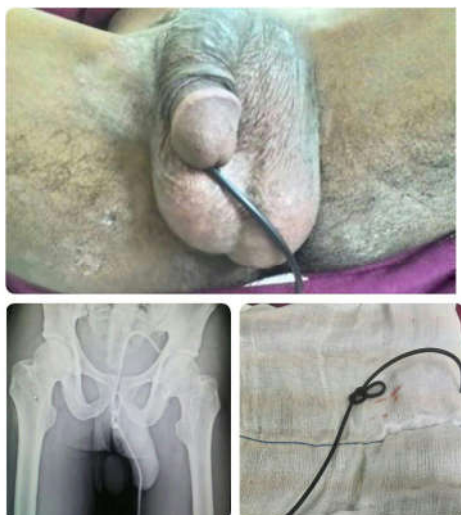
Figure 3 Electric wire in bladder