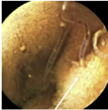
Image 1 Small bowel parasitosis in distal duodenum in a patient presenting with Obscure GI bleed