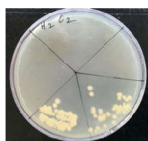
Hydrogen peroxide 5%