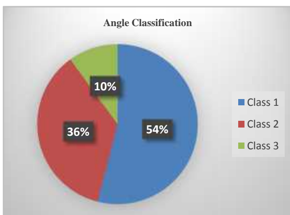
The examination done using Angle classification it was found that 81 people had class 1 malocclusion, 54 people had class 2 malocclusion and 15 people had class 3 malocclusion.