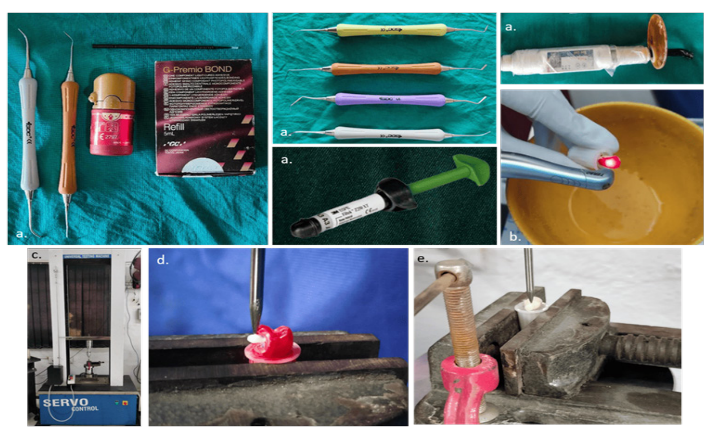
Figure 3 a. Armamentarium;b. application of laser to samples; c. Universal Testing Machine; d. & e. jig with 4x1/8th inch with cross head of 1mm/min

min as recommended by the International Organization for Standardization. ^{\left( 16\right) }