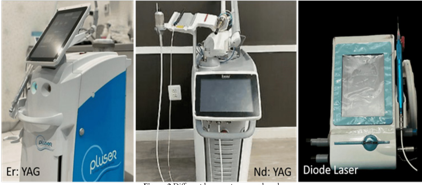
Figure 2 Different laser systems employed Table 2 Multiple comparison between groups using post hoc