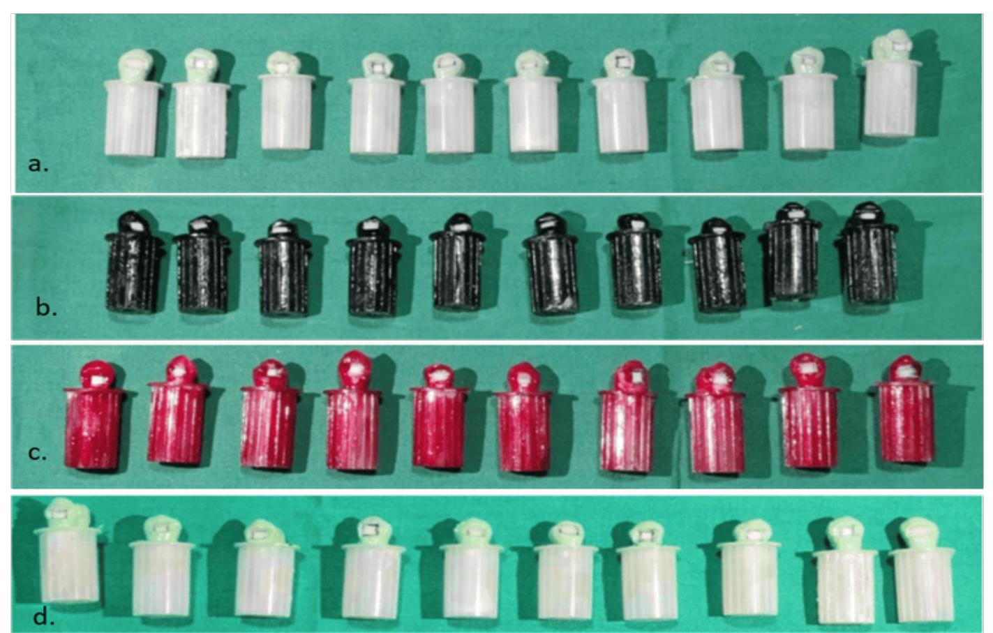
Figure 1 Specimens divided into 4 groups: a.Control; b. Group E (Er: YAG); c. Group N (Nd: YAG); d. Group D (Diode laser)