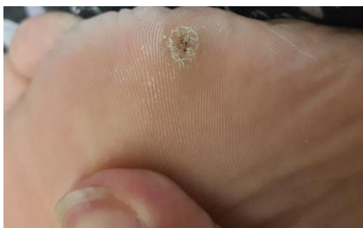
Fig. 2A Group A P2: at baseline