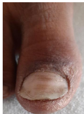
Fig. 1C Group A P1: at 6 th week