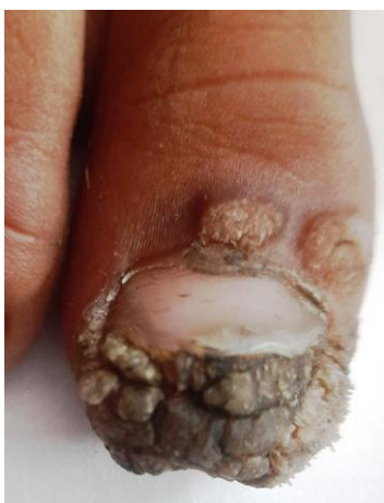
Fig. 1A Group A P1: at baseline