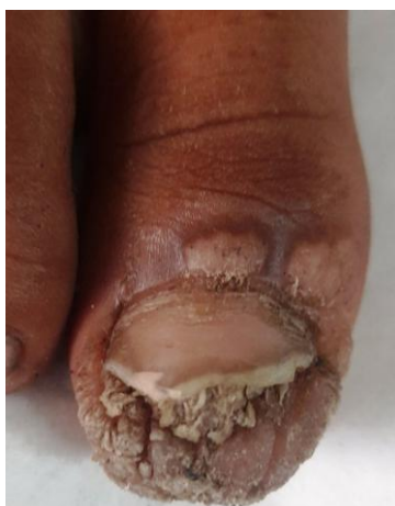
Fig. 1B Group A P1: at 2 nd week