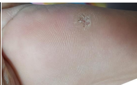
Fig. 2B: Group A P2: at 4 th week