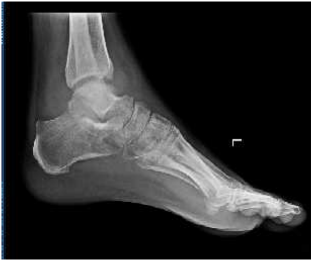
Fig 1 X Ray of ankle with foot showing soft tissue shadow and articular irregularity of ankle

able to perform daily activities without restrictions. Further improvement was observed at 9 months at the completion of chemotherapy.