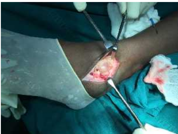
Fig 3 Intra operative image showing arthroscopy of ankle joint with anterio lateral approach