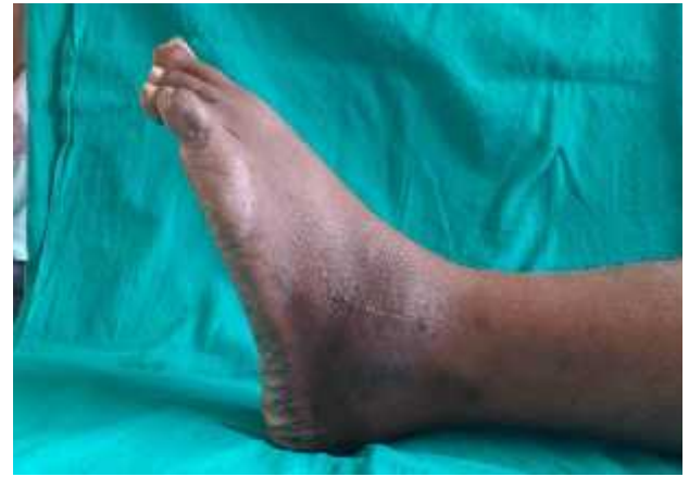
Fig 4 At 6 weeks post-surgery, reduced swelling and stiff ankle which was managed with physiotherapy.