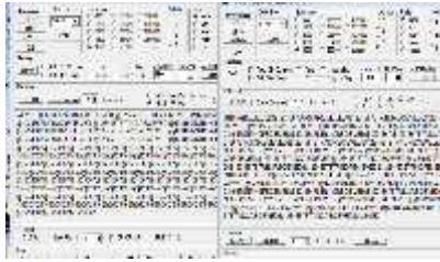
Fig. 4 Communication between two nodes

The results obtained are for one module that is the CAN module. Also the results for the datalink layer required for the protocol along with its physical layer are obtained.