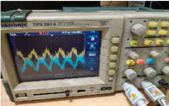
Fig 5 CANH and CANL signals

The signals obtained are checked on the digital oscilloscope to determine the recessive and dominant bits obtained.