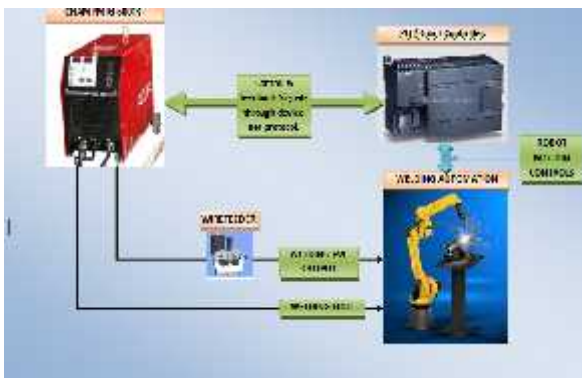
Fig. 1 Block Diagram of Overall System

The power supply used is inverter type which is working on 415V ac, 50 Hz supply and there is no step down transformer. The main objective behind all this is to implement a digital based communication protocol. Further exploration can be done by creating redundancy at the bus level.