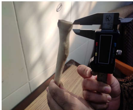
Diagram 1 showing measurement of thickness of ventral curve (TVC) by digital vernier caliper