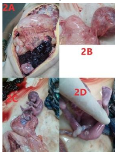
Image 2A-Peritoneal cavity showing blood clots and fluid blood. 2B- Showing puncture at left fallopian tube. 2C-Hemorrhagic clot in uterus and ectopic pregnancy. 2D-Fetal Genitalia.

One of the on duty doctor rejected the above-mentioned cause of death certificate. Suspecting some foul play, this incidence was immediately reported to the concerned police station as medicolegal case requiring investigation by the police. Subsequently medico-legal postmortem examination was ordered by the investigation authority to confirm the cause and manner of death on the same day.