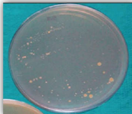
Fig 1 Microbial colony count of Cheerio