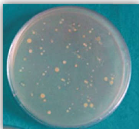
Fig 3 Microbial colony count of Vicco Vajradanti