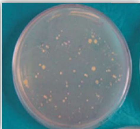
Fig 2 Microbial colony count of Himalaya