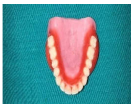
Fig 9 Modelling wax incrementally added