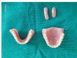
Fig 10 Acrylic denture