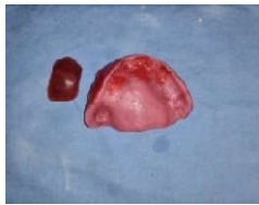
Fig 4 Waxup of labial plumper