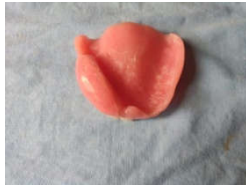
Fig 5 Acrylic denture