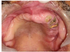
Fig 1 Intra oral