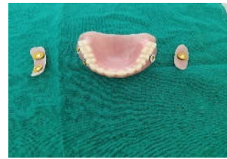
Fig 11 Cheek plumper with magnet