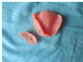
Fig 6 Denture with detachable labial plumper