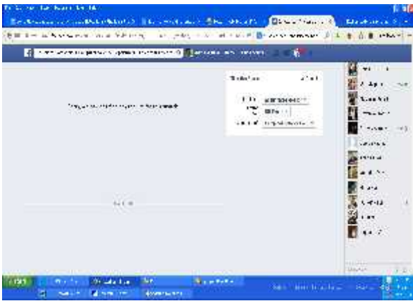
The output is: Sorry we couldn't find any results for this search

3. Assistant Professors in the Computer Science department