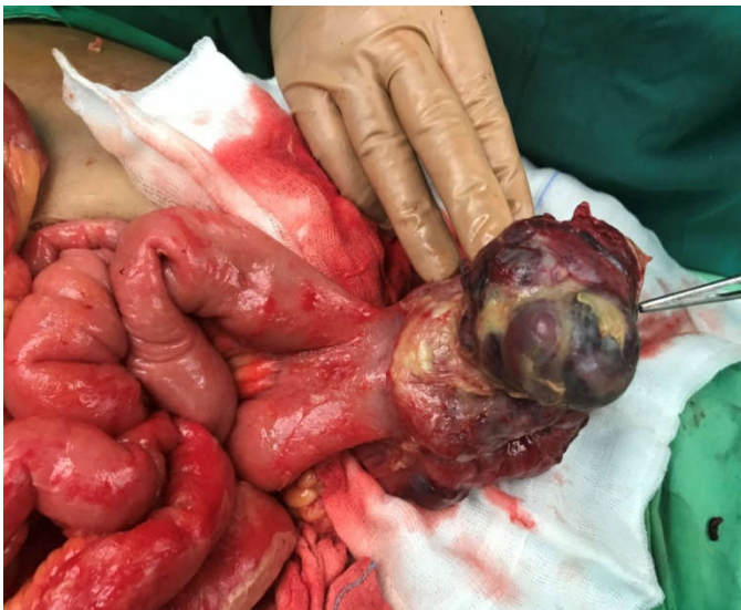
Fig.2a Small intestine GIST