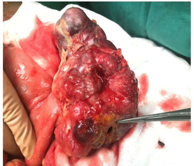
Fig.2b Small intestine GIST

HPE Report shows- Spindle Cell Neoplasm Favouing Gastro Intestinal Stromal (GIST )Tumour (Fig 3).post operative period uneventfull & Patient discharged on 11 th post op day.