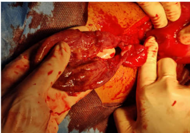
Fig 3 Showing Gangrenous Changes in The Herniated Bowel Loop After Reduction

Long Arrow: Representing Perforation in Posterior Wall of Uterus Short Arrow: Representing Bowel Loops Entering Into the Uterine Perforation