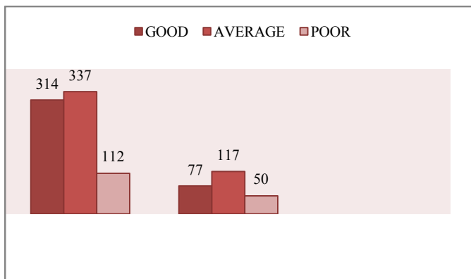
Figure 3 School performance of children with out and with refractive error

In this study, school performance was significantly affected by uncorrected Refractive errors. Majority of children (45.1%) had average school performance and 16.1 % had poor school performance.