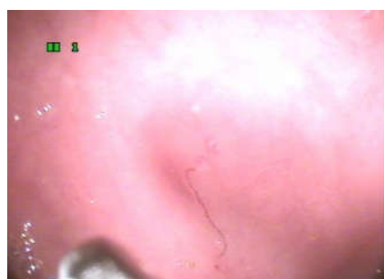
Figure 3 single hookworms in duodenum with its bent head like a hook and S-shaped appearance in the same patient with mild Anaemia [haemoglobin 10g/dl or g%] with negative stool examination for hookworm ova [different view].