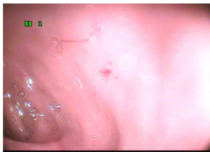
Figure 2 single hookworms in duodenum with its bent head like a Hook and S-shaped appearance in the same patient with Mild Anaemia [haemoglobin 10g/dl or g%] with Negative Stool Examination for hookworm Ova [different view].