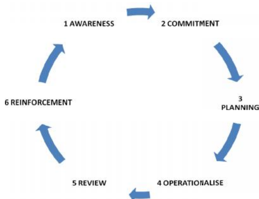
Figure 2 Internationalisation Cycle

A key strategy to the development of organisational strategies and models is to consider the internationalisation process as a continuous cycle and not a linear or static process. Knight (1994) proposed a cycle with six phases which an institution would move through at its own pace as shown below.